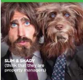
SLIM & SHADY (think that they are property managers)

26 years specialising in: • Rental properties • Residential property management • Commercial leasing & management Experience lives here: 0800 466 3946 www.goodwinrealty.co.nz